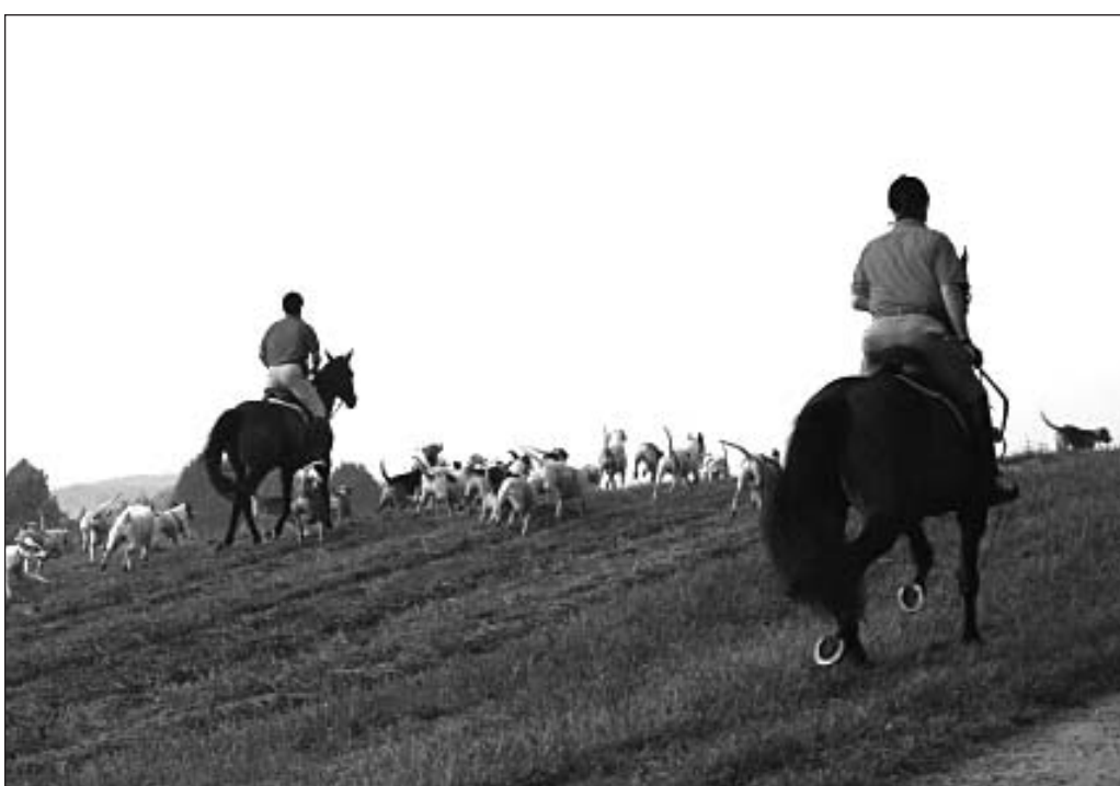
With a ban on fox hunting in the U.K., the British travelers were eager to see what the American sport is like. They were impressed with the hunters' hospitality.

They are also based more in the mountain region of the state, and open, maintain and clear trails all by themselves, which means they are more used to riding